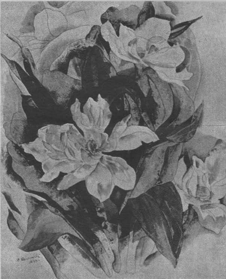
Peonies , a typical Demuth flower painting in the Honolulu Academy of Arts, Hawaii.